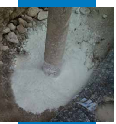
Application of Mapeproof Seal around through piping