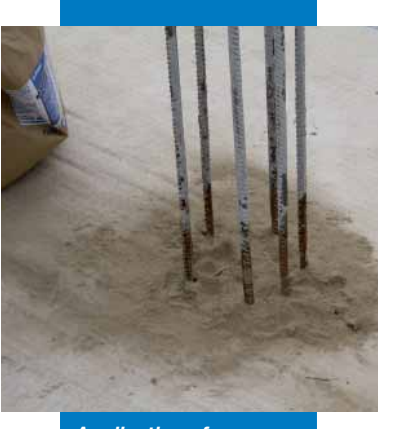
Application of Mapeproof Seal before a piece of Mapeproof bentonite sheet